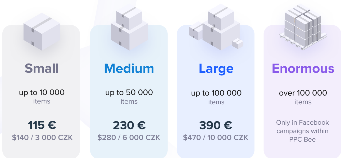
Image Editor for Facebook Stand Alone

Without the option of consolidation (counting of the items for Image Editor across different data feeds)